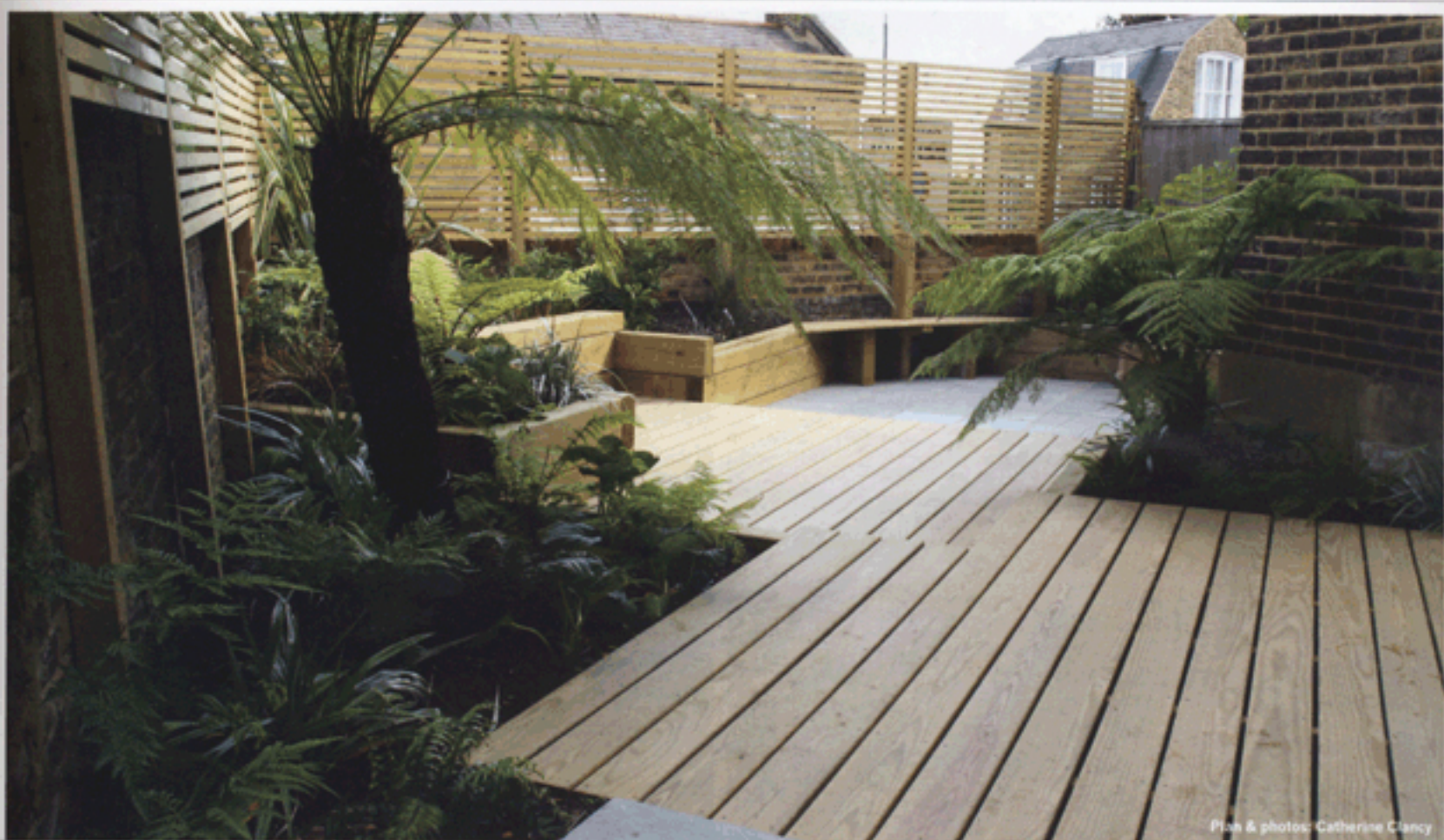
Plan &amp; photos: Catherine Clancy